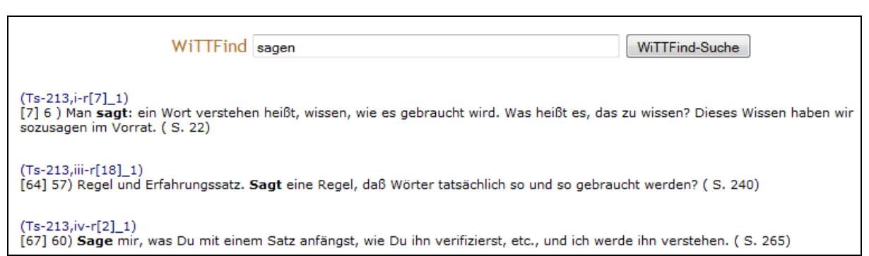
Figure 1: Query to WiTTFind

By clicking on the "Satzsiglum" the user can view our triptych-display showing scans of Wittgenstein's original double-sided typescript and annotations. (Figure 2)